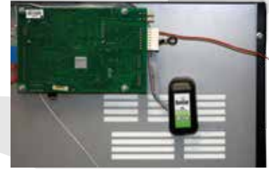
Detail View of CID

The No-Gassing feature of the 2 Circuit Eclipse II Plus allows a programmable time to be set so that should the charger reach the gassing portion of the charge cycle within the set time, the charger would stop charging until the set time has elapsed. Only at this point would the charger continue to charge and take the battery to charge complete.