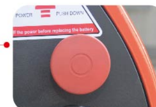
Emergency Power-off Switch