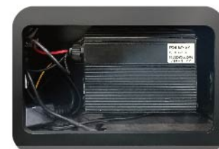
Built-in Charger (Optional)