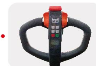
Smart Handle (Optional)