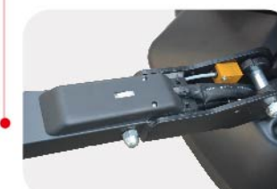
Wire Harness Fixing Block